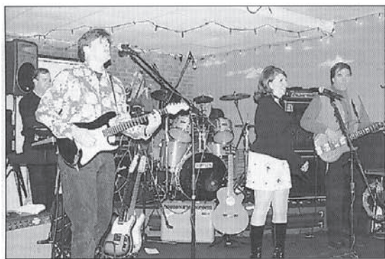
The English Channel performs Saturday at the Boulevard Deli.

The English Channel re-creates British oldies — just like you remember them