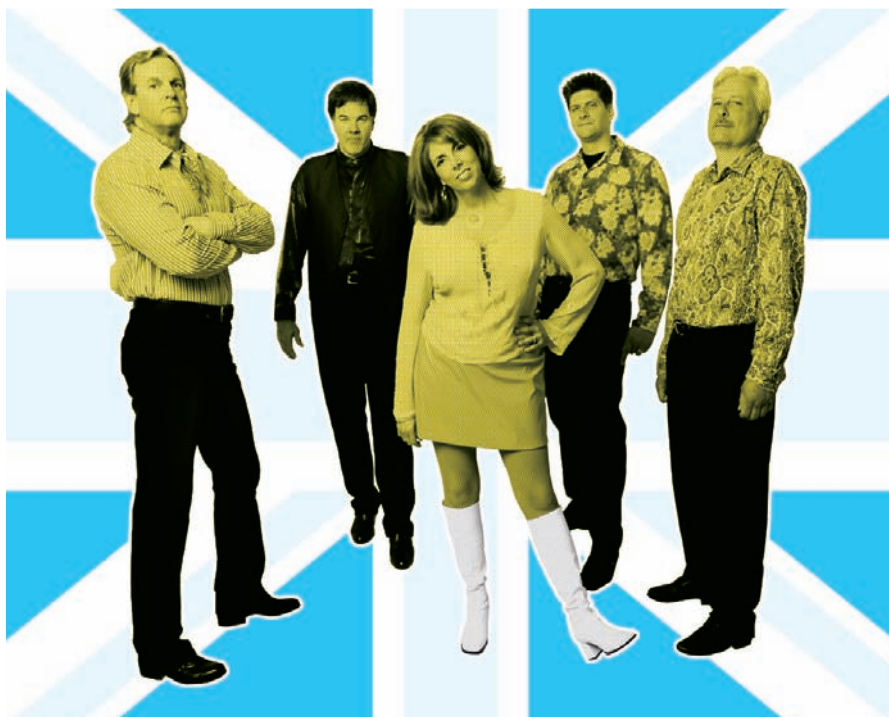
THE ENGLISH CHANNEL (L to R)

THE ENGLISH CHANNEL is a band of five gifted musicians from Richmond, Virginia, whose reputation for being able to transport people back to the happiest time and place of their lives, the late 60's, has made them "the most talked about new band in the South." People who come to see THE ENGLISH CHANNEL are taken to a virtual theme park that exists in a place known as "your fondest memories." THE ENGLISH CHANNEL is the American experience of the British Invasion, and your pathway to get back to where you once belonged.